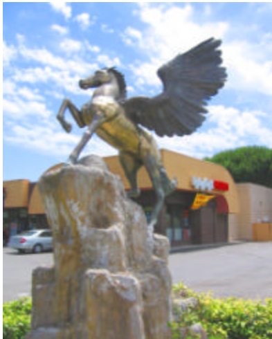
Fountain of Hippocrene (located between Paseo Padre Parkway and Enea Streets)

http://www.aclibrary.org/branches/frm/default.asp?topic=FremontMain&cat=FRMPublicArtIndex