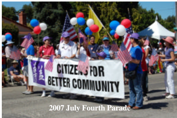
2007 July Fourth Parade

Congratulations to CBC for winning 3 rd place in the Novelty Non-Profit Division in Fremont's 2007 July Fourth Parade held in Niles. CBC's entry included over 200 people from several organizations. (see page 4 for more details)