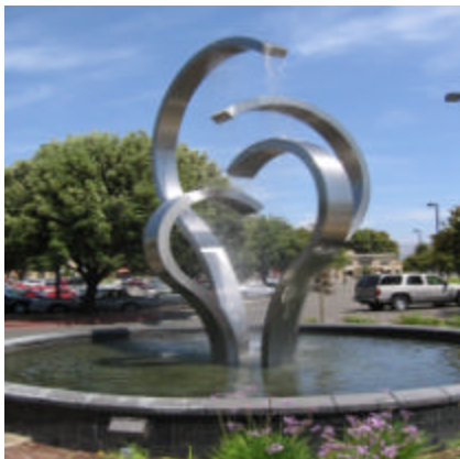
Harmony of Shape (located at Mowry Avenue and Paseo Padre Parkway, Washington Hospital Shopping Center)