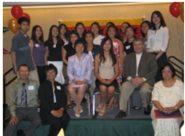
2004 Scholarship Recipients