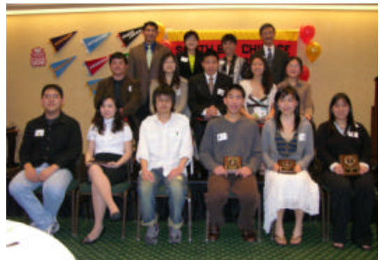
2007 Scholarship Luncheon

If you have any questions or comments regarding the SBCSC Scholarship program, please let me know at willy51@aol.com , or (510) 792-6961. Thank you.