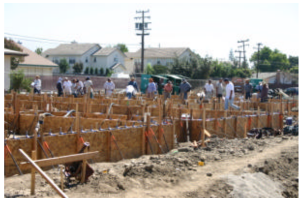
Construction begins on the FCSN "Dream Center"