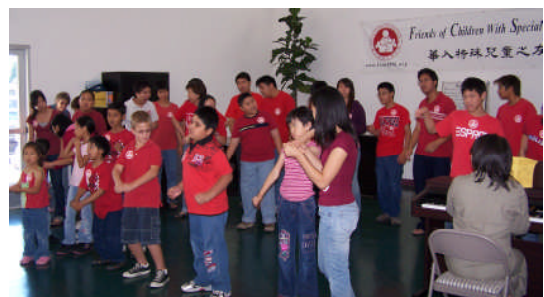
FCSN Summer Youth Music Camp for children with special needs.

FCSN will also host an open house to celebrate the one-year anniversary of the "Dream Center" on Peralta Blvd on Friday, October 12. If you would like to learn more about FCSN's program, please RSVP to Sylvia at (510) 739-6900.