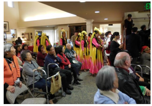
Con't on page 4