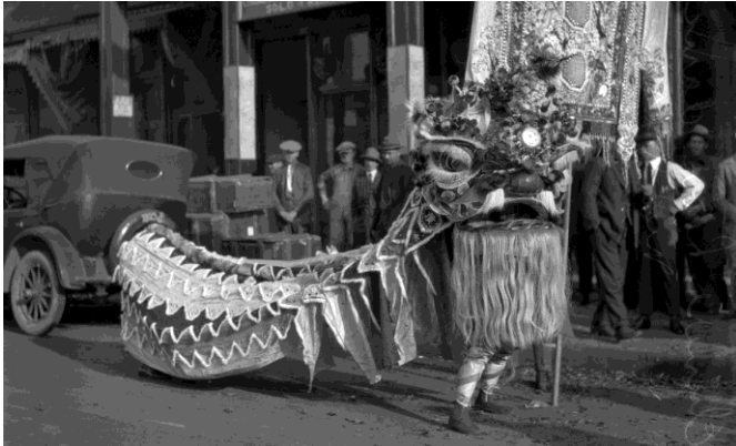
Chinese lion during festival in Chinatown, Los Angeles, circa 1920-1939.

https://www.californiamuseum.org/gold-mountain