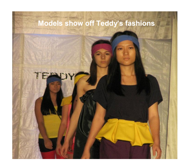
CBC thanks everyone who made it a successful event!