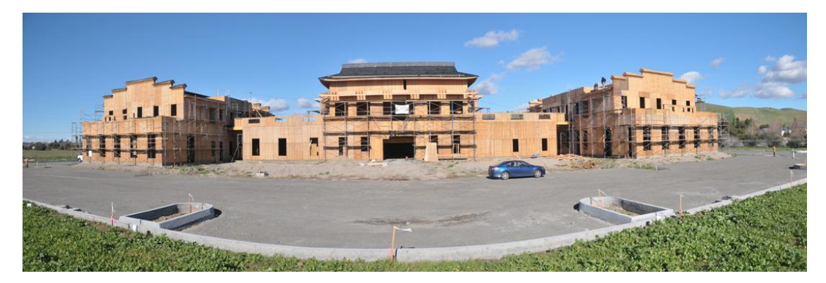
Construction Progress in 1<sup>st</sup> Quarter of 2013

The future home of the Purple Lotus Temple is adjacent to the beautiful 471 acre Quarry Lakes Recreation Park in Fremont, CA. PLT's vision is to build a blessed future for everyone from all walks of life, regardless of ethnicity, nationality or religious beliefs.