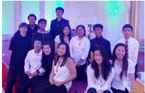
Wonderful student volunteers pause for a breather