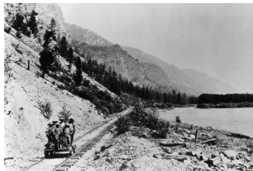
San Francisco Chronicle, May 4, 2019

https://www.deseretnews.com/article/900069988/thousands-gathering-to-mark-150th-anniversary-of-transcontinental-railroad.html?fbclid=IwAR3fTfniervuwmr41V6lFT8H8ub2Zk4flgsN4b31E5pR876kqc5Nhlino00