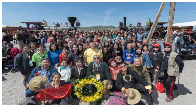
NBC News, May 10, 2019

https://www.nbcnews.com/news/asian-america/thousands-gather-reclaim-chinese-railroad-workers-place-history-n1004536?fbclid=IwAR1L4ZZedm0HxKRzjBDvdZVhAwPQMY1SAaqW8q0V_EfnZvLvK1k1I9qJkxg